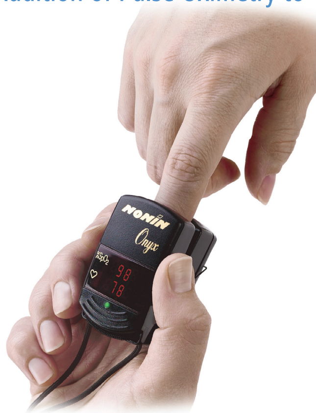
The original Onyx ® finger pulse oximeter (above) and the more recent Onyx Vantage 9590 use the same clinically proven Nonin PureSAT ® SpO 2 technology.