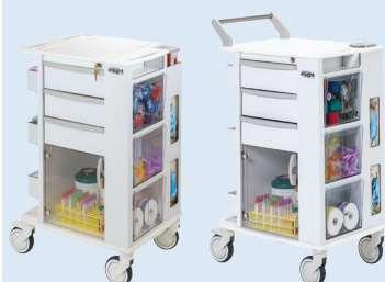
ML21491 Phlebotomy Cart

Lightweight maneuverability with maximum storage