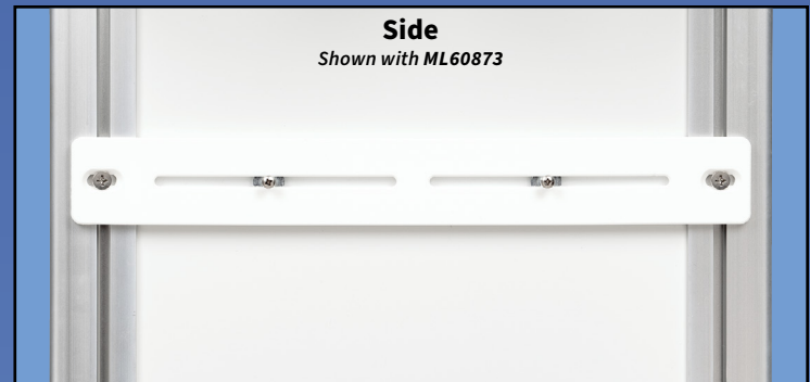
Side Shown with ML60873