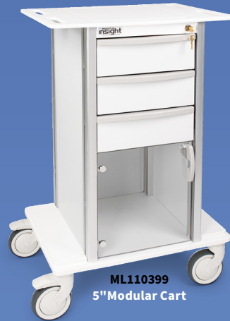
ML110399 5" Modular Cart