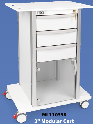
ML110398 3" Modular Cart