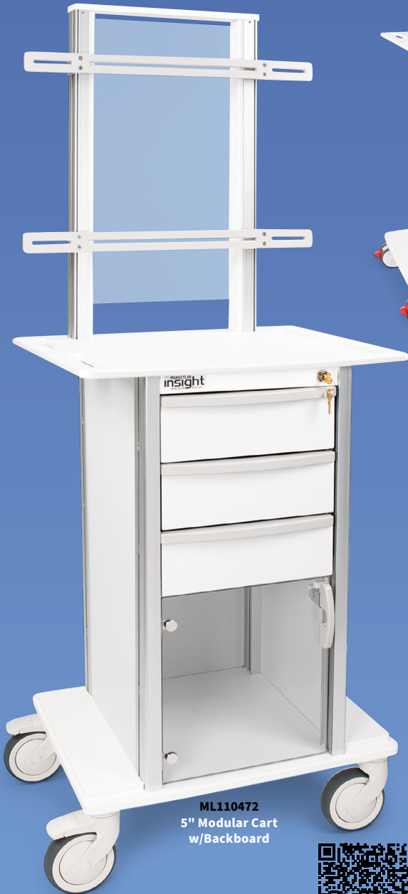
ML110472 5" Modular Cart w/Backboard