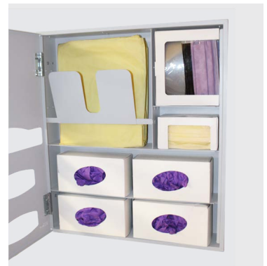
Modern hospital designs require next level PPE solutions that comply with the ADA 4 inch depth guidelines. Shown above: Top-Selling BOWMAN Protection System RE101-0012