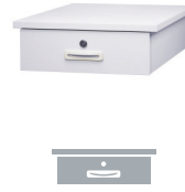
Drawer 3.9"H (9.9cm) Occupies 3 Cells