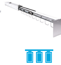
Catheter Rack Occupies 3 Cells