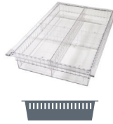
Polycarbonate or ABS Bin 4"H (10cm) Occupies 2 Cells