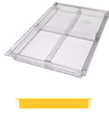
Polycarbonate Bin 2"H (5cm) Occupies 1 Cell