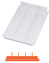
Metal Shelf Occupies 2 Cells