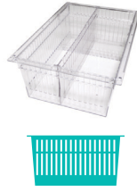
Polycarbonate or ABS Bin 8"H (20cm) Occupies 3 Cells