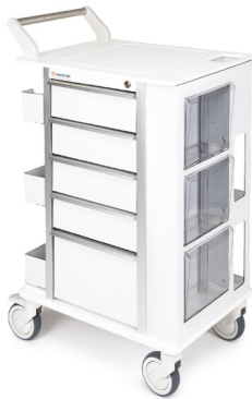
ML138758 5 Drawers, Key Lock

*(8.5" bottom drawer on 5-drawer models)