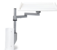
Articulating Platform ML105523