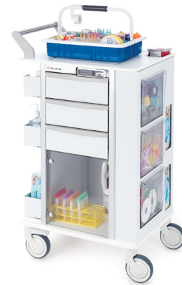
ML101878E 3 Drawers, E-Lock