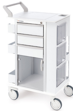
ML101878 3 Drawers, Key Lock