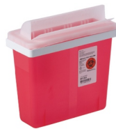
5qt Sharps Container ML20596 In ML110546 or ML41260 Bracket