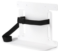
Universal Sharps & Waste Bin Holder ML110546 Mounts on rear side of cart