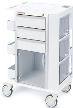
ML21491 3 Drawers, Key Lock