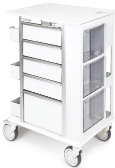
ML138760E 5 Drawers, E-Lock

*(8.5" bottom drawer on 5-drawer models)