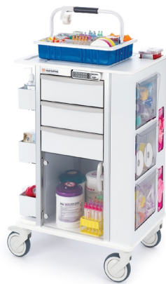
ML21491E 3 Drawers, E-Lock