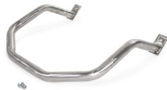
Ergo Handle ML108141 Mounts to Worksurface