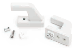
Multi-Use Hook 106921