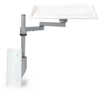
Articulating Platform 105523