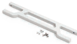
Cord Wrap 106920