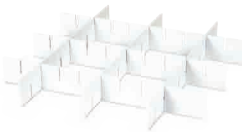
3"H Drawer Divider Set 21641