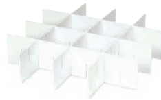
6"H Drawer Divider Set 21642